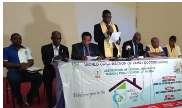
Photo 3: Association of General and Private Medical Practitioners of Nigeria Lagos Chapter members addressing press conference.