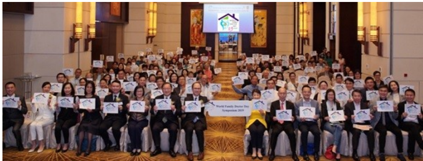
Photo 1: VIPs, Speakers, and all participants celebrating FDD 2019