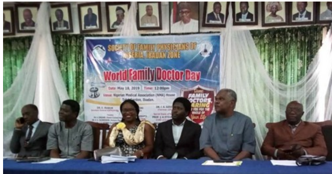
Photo 1: Members of Society of Family Physicians of Nigeria Ibadan zone lectures / press interview

World Family Doctor Day was well celebrated in Nigeria. Activities from 17-20 May in nearly all the states, most were jointly sponsored by our WONCA Member Organizations in Nigeria. Activities included : Public enlightenment campaigns through press releases and interviews in print and electronic media; advocacy visit to Minister of Health; road shows, free medical outreaches, lectures, rallies.