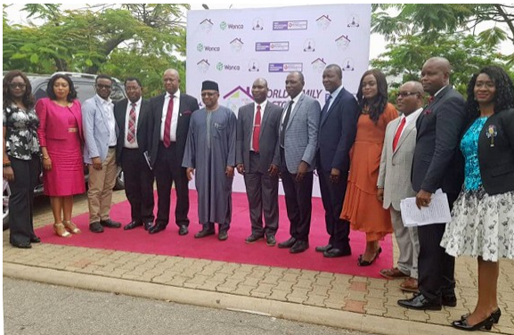
Photo 2: Some leaders of Family Doctors in Nigeria with the Health Minister of State in Abuja

World Family Doctor Day was well celebrated in Nigeria. Activities from 17-20 May in nearly all the states, most were jointly sponsored by our WONCA Member Organizations in Nigeria. Activities included : Public enlightenment campaigns through press releases and interviews in print and electronic media; advocacy visit to Minister of Health; road shows, free medical outreaches, lectures, rallies.